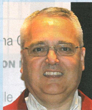
Truckload Carriers Association